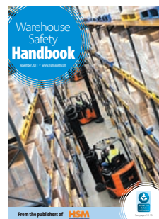
The 2011 Handbook series